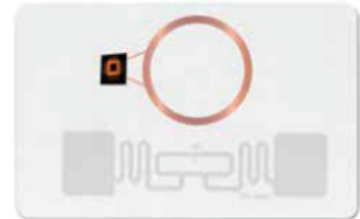
9662+ID UHF+ID EM 125KHz