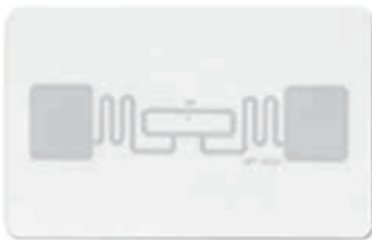
9662 85 x 54mm